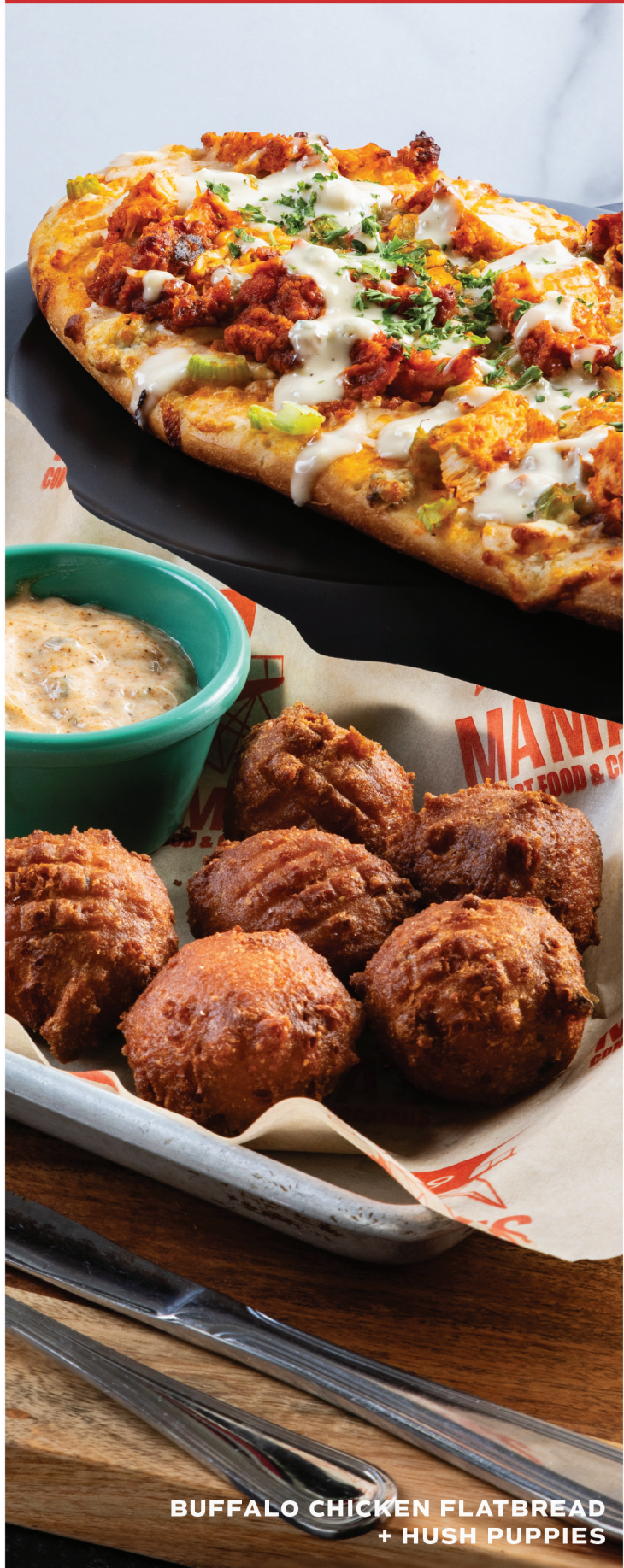
BUFFALO CHICKEN FLATBREAD + HUSH PUPPIES