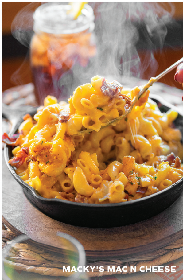
MACKY'S MAC N CHEESE

MACKY'S MAC N CHEESE .....$19.99 Enough for the whole table! Mother's homemade mac n' cheese with artisanal cheeses 'n bacon.