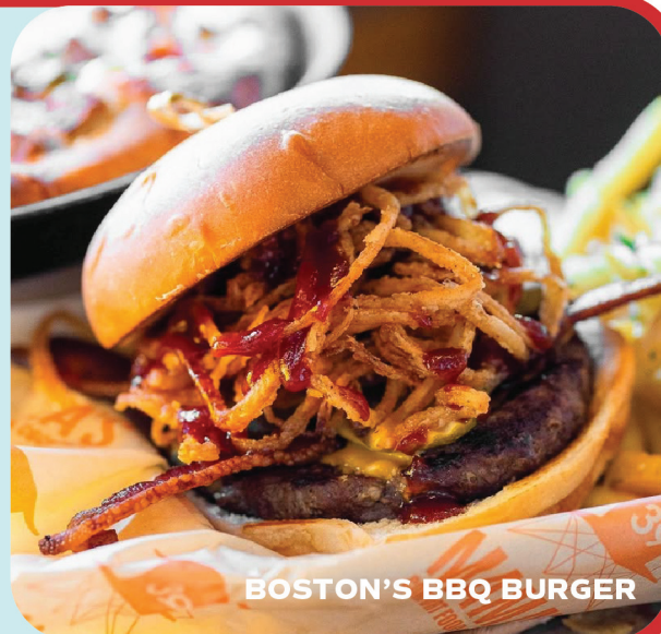
BOSTON'S BBQ BURGER

"THE MONSTER BURGER".....$28.39 Over a pound of char-grilled choice beef, BBQ sliced prime rib, 4 slices ALL-AMERICAN cheese, 4 strips of smoked bacon. Fried onion strings and Mother's special sauce.