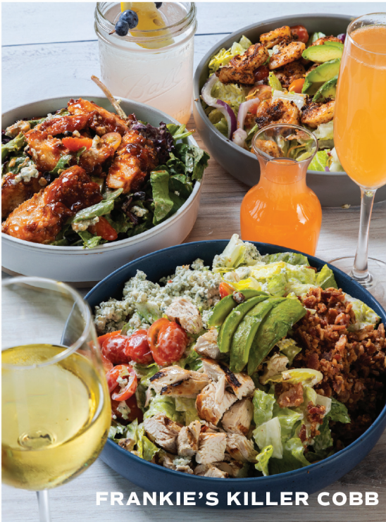
FRANKIE'S KILLER COBB

Romaine and iceberg lettuce, cherry tomatoes, shredded cheddar cheese, croutons and your choice of dressing.